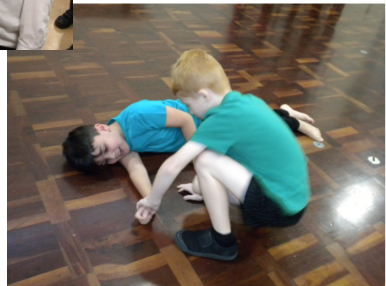
In PE we talked about the parts of the body and muscles we were using. We felt our heart beat and put each other in the recovery position.