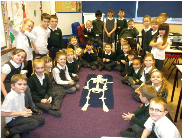
We assembled the Velcro skeleton and then added labels for the main bones

We have done lots of work about Florence Nightingale. In History we have found out about her life, why she is famous and how she improved hospitals and nursing. In Geography we looked at a map of Europe to find key places that Florence visited. In English we learned to write Information texts. In Science we learned all about our body and healthy living. We used the Red Cross website to learn simple First Aid. We looked at Braille on medicine boxes and had great fun practising our First Aid on each other!