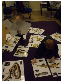
We looked at how animal skeletons are different to human skeletons.