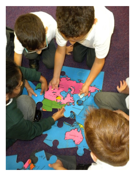
We have learned the names of the 7 continents and 5 oceans.

We are learning where the hot and cold places are in the world. We are beginning to learn about the habitats and climate in these parts of our world.